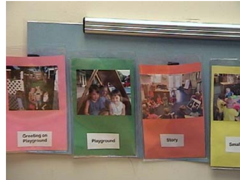
Class photo schedule in clear pockets for easy removal.