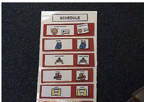
Boardmaker® schedule pictures with removable miniatures to carry while transitioning from one location to another.